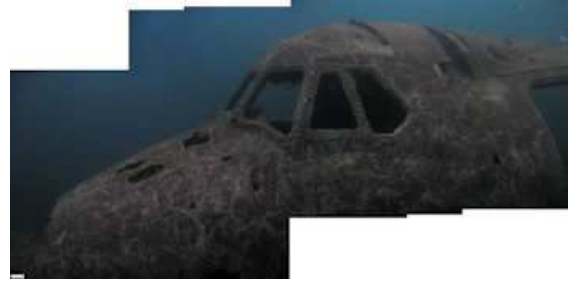
A composite image of the Viscount Cockpit

This cold water madness was repeated on the 4 th of Jan when Joe and Myself again set off for Stoney. This time it was colder but the vis was still amazing at least 10 meters, at the end of the first dive (45 minutes) we were making a safety stop on the permanent line from the Staingarh when i must admit my fingers were getting cold. During the surface interval it was cold enough for ice to form on any wet surface.