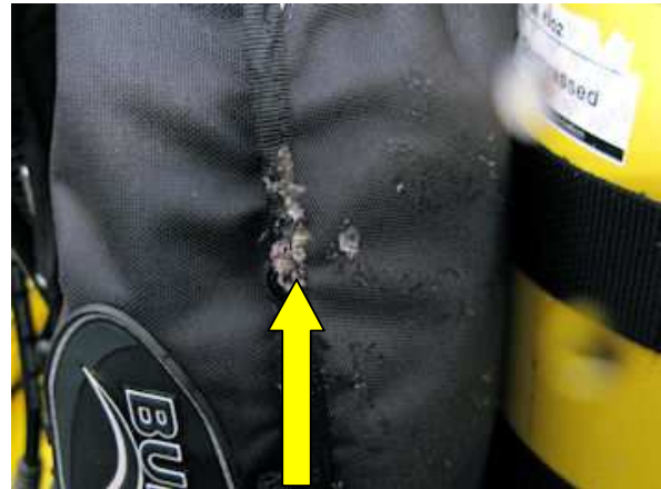
Ice forming on my wing

This cold water madness was repeated on the 4 th of Jan when Joe and Myself again set off for Stoney. This time it was colder but the vis was still amazing at least 10 meters, at the end of the first dive (45 minutes) we were making a safety stop on the permanent line from the Staingarh when i must admit my fingers were getting cold. During the surface interval it was cold enough for ice to form on any wet surface.